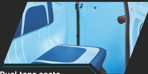
Dual tone seats